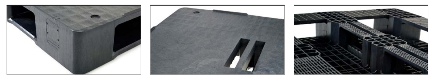
*<sup>1</sup> Figures can vary depending on the raw material used and options applied. *<sup>2</sup> Guideline values are based both on experience and parts of test ISO 8611, which tests with evenly distributed loads at room temperature (20°C). Varying data may result from different conditions of usage. Your specific requirements can be identified upon request. *<sup>3</sup> Minimum quantity required - PO pallets should only be used and stored in a dry environment. We reserve the right to change any of the stated information without prior notice.