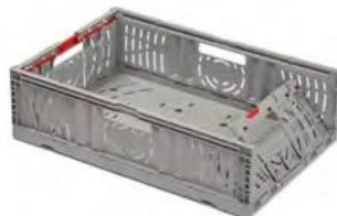
Set up short sides vertically until they lock into place. Make sure all closures lock into place at the 4 corners.