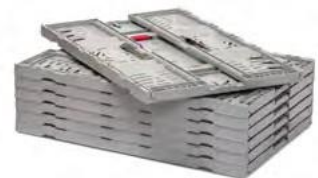
Stack with the bottom side facing down