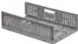
Set up long sides vertically